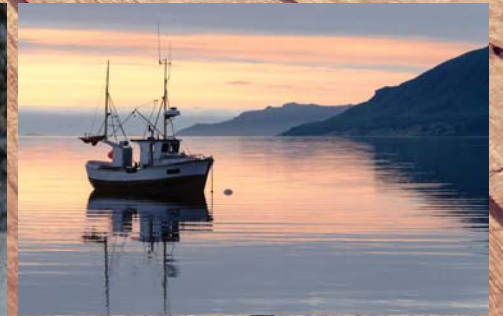
#15 Boat at Anchor