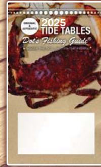
Stock Picture #5