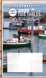
Stock Picture #4