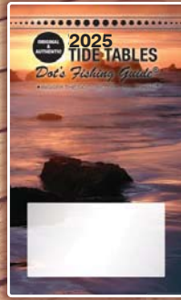
Stock Picture #2