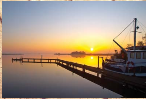
#11 Dock Sunrise