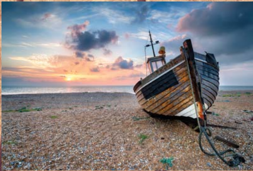
#13 Beach Dory