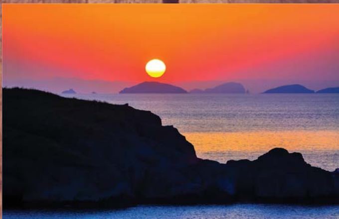
#18 Red Sunset