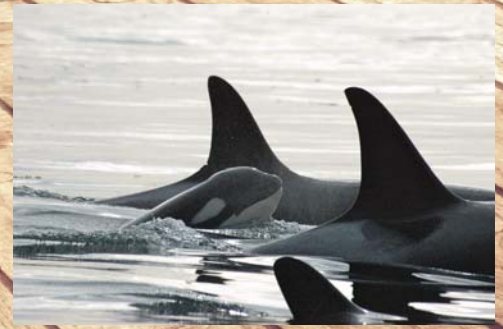
#12 Orca Baby