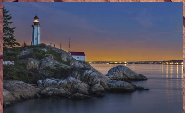
#17 Lighthouse dusk