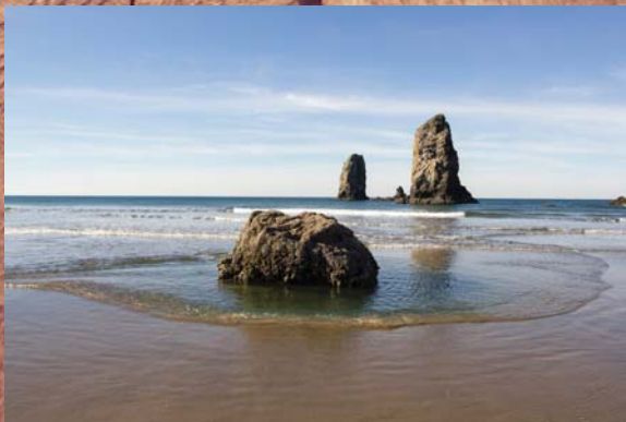
#16 Beach Rocks