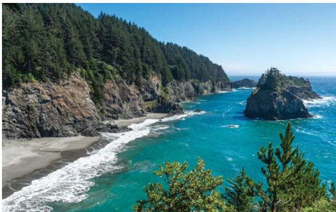
#20 Blue Beach