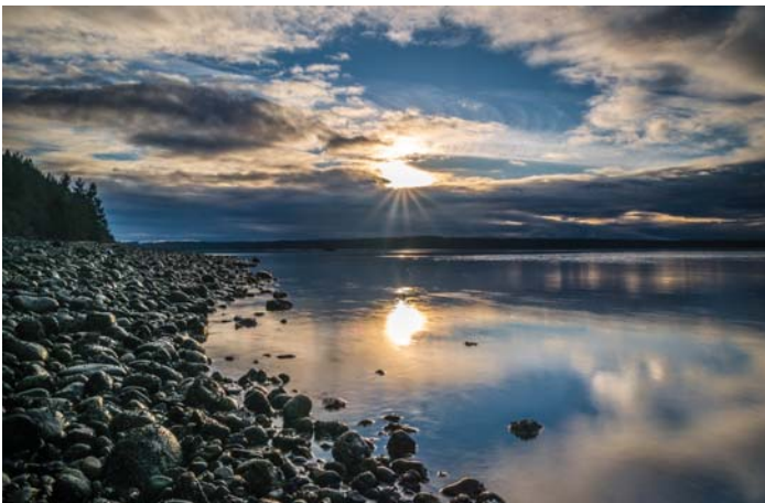
#27 Rocky beach sunrise