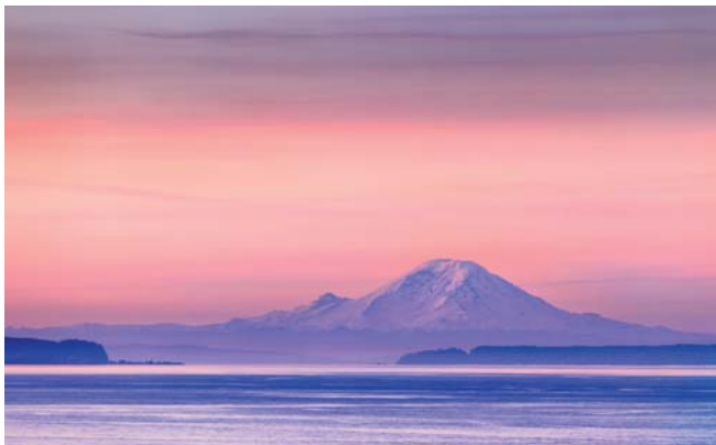
#25 Purple Mountain