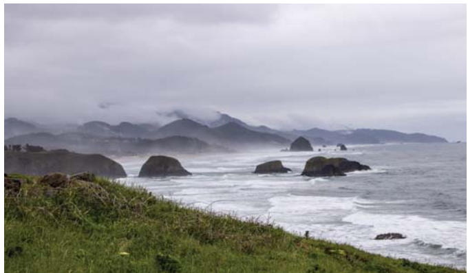
#22 Cloudy Beach