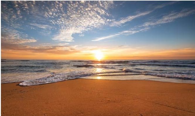
#23 Gold Beach